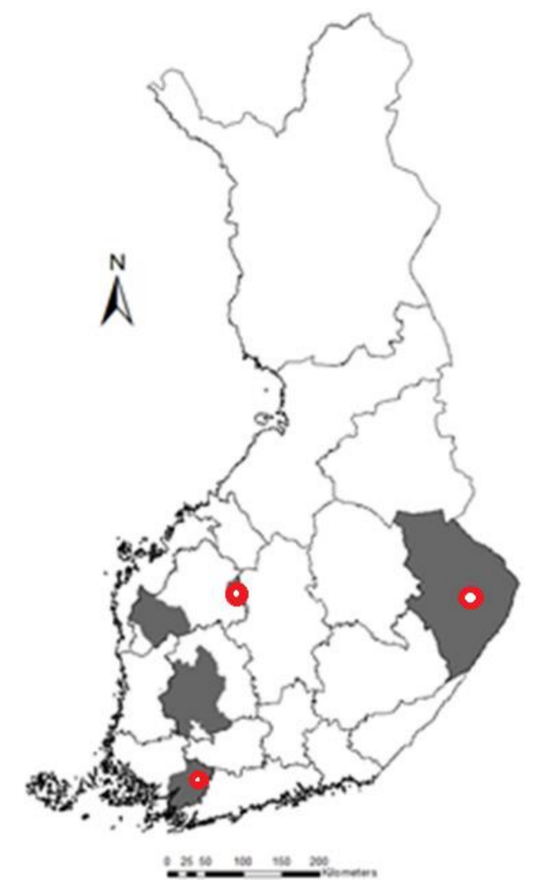
Picture 1. Map of study areas and locations of focus group discussions (Rekijokilaakso, Virrat, Joensuu). Map: National Land Survey of Finland

The discussions lasted about two hours each. They were recorded and transcribed. The data-driven analysis method was used. The analysis was directed by a conceptual framework formed by the analysis question: Which FMP and advisory practices enhance or hinder the multi-objectivity or nature management emphasizing in holding level planning and how?